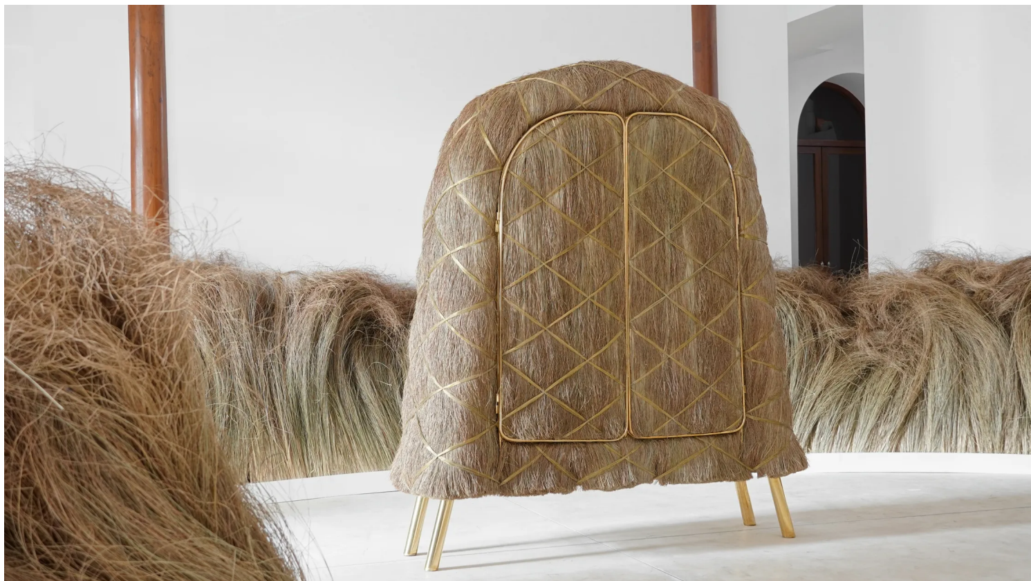
Bombay-based collectible design gallery Galerie Æquō will unveil a collaboration with the Brazilian creative studio Estúdio Campana at PAD Paris 2024.

PAD Paris, short for Pavilion of Art and Design, is back. One of the most anticipated events in the art and design calendar, PAD is renowned for its fusion of art, design and craftsmanship and a huge draw seasoned collectors and enthusiasts alike.